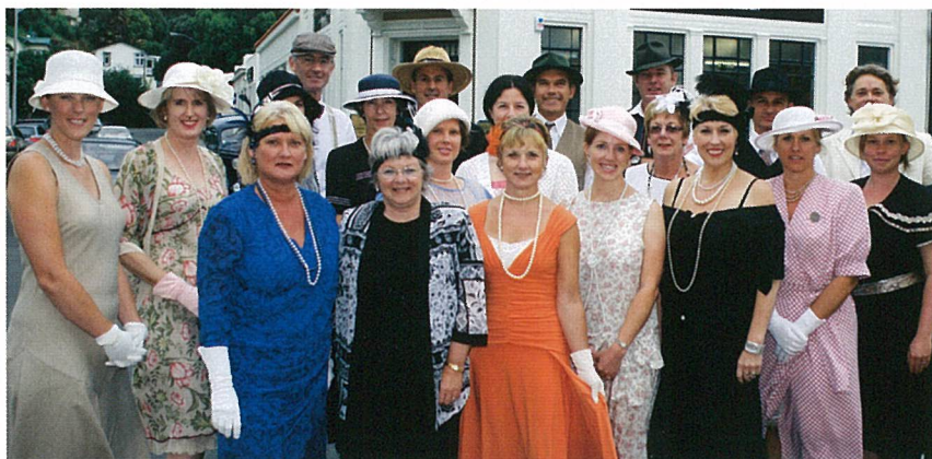
Above and above right: Art Deco day at the SLW office.

We recommend these important issues are carefully considered when documenting your Will and a Trust may be the best way to meet the family objectives.