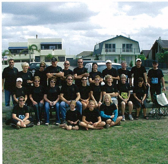
Above: The SLW team enjoy the Tremains triathlon