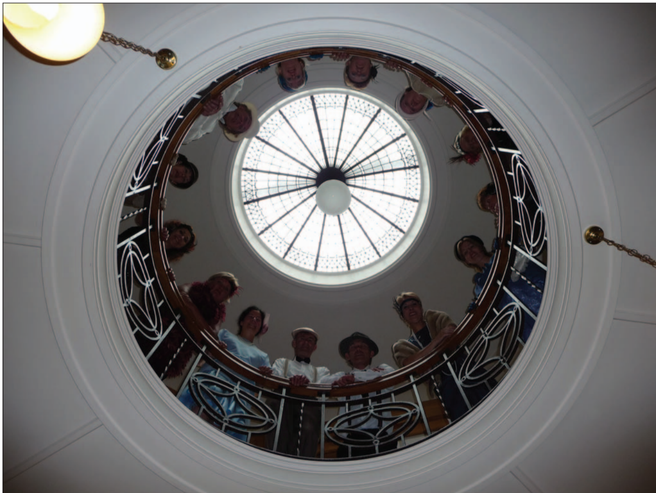
(C11_7): Staff scattered around the bannister below the cupola, Art Deco Weekend 2008.